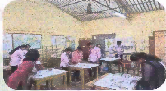
Poster Measurement & Draw