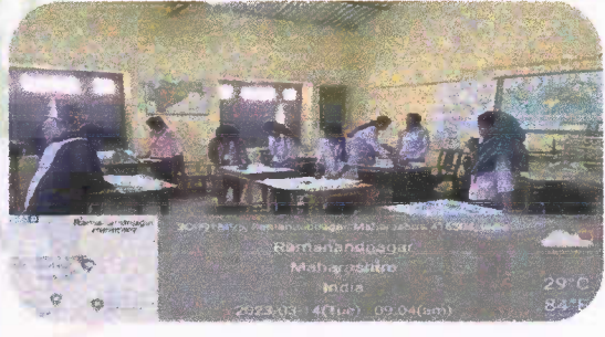
Students Discuss with Teacher