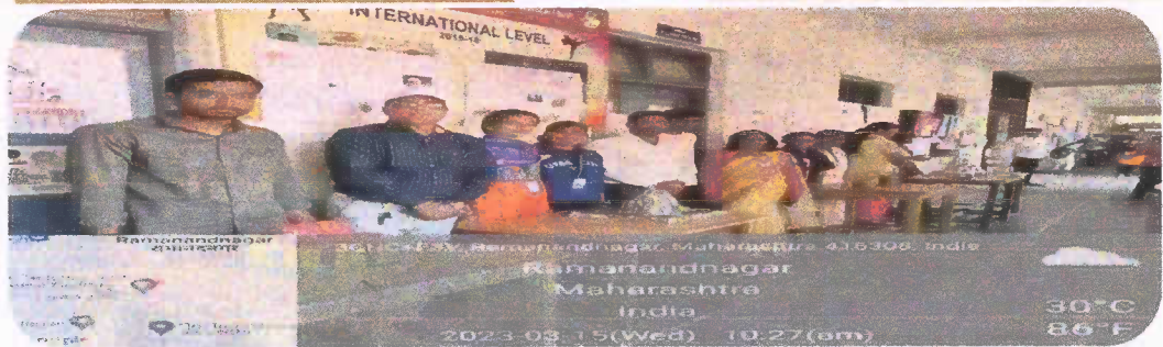
Students with their Models & Posters in Competition

[Signature] 17/3/23 Committee Chairperson